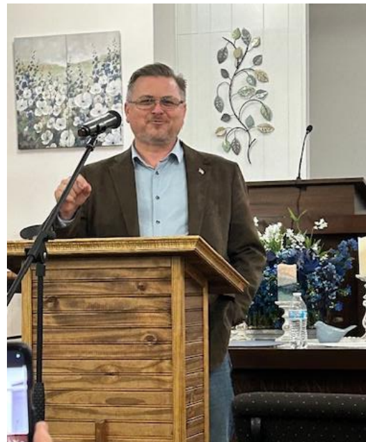
Figure 4 Speaking at Grace Valley Baptist Church