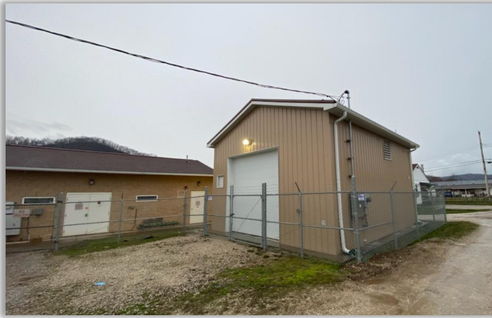
Figure 1 Paden City Air Stripper

Here are some pictures from our last visit to Paden city.