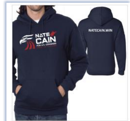
Nate Cain for US Congress Navy Hooded Pullover

Did you know we have campaign merchandize? The following is just a sampling of what we have available – Remember Mother’s Day and Father’s Day are right around the corner