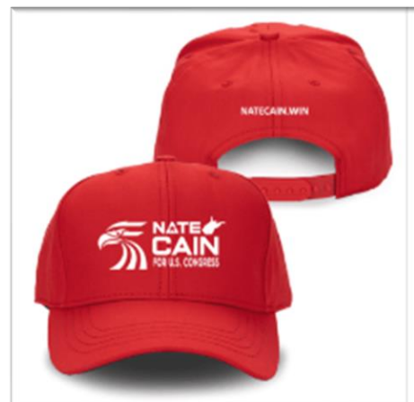
Nate Cain for US Congress Red Structured Adjustable Hat

Check out our storefront here for these and many other items.