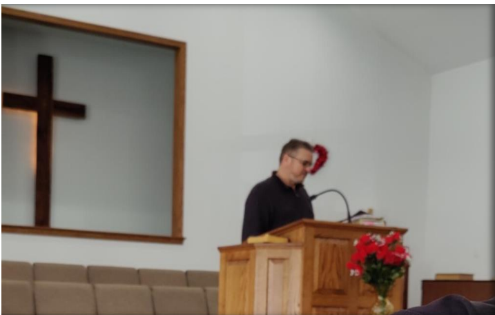
Figure 2 Speaking at Pennsboro Baptist Church

This is the Paden City Water Commission recorder – He was doing a crossword puzzle while residents were describing their personal experiences with the water issue.