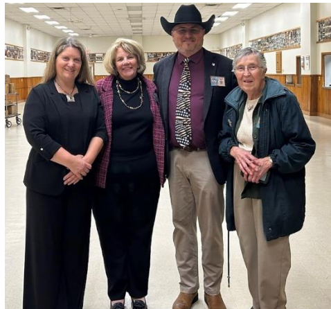
Figure 2 -- Preston County Lincoln Dinner