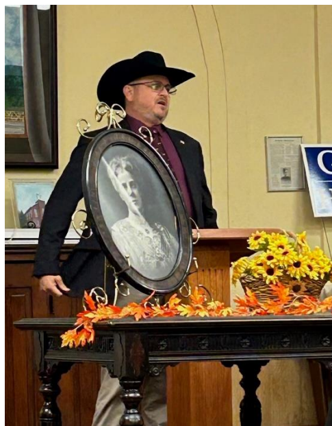
Figure 3 --- Taylor County Lincoln Dinner