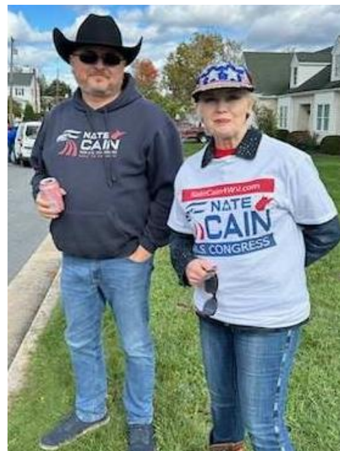
Figure 4 --- Mountain State Apple Harvest Festival