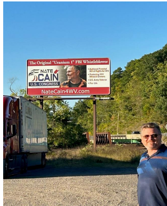
Figure 5 -- Billboard on Route 2

supporters which saves on travel expenses.